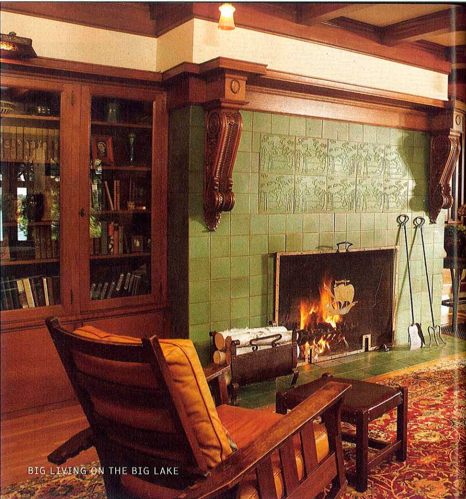
BIG LIVING ON THE BIG LAKE