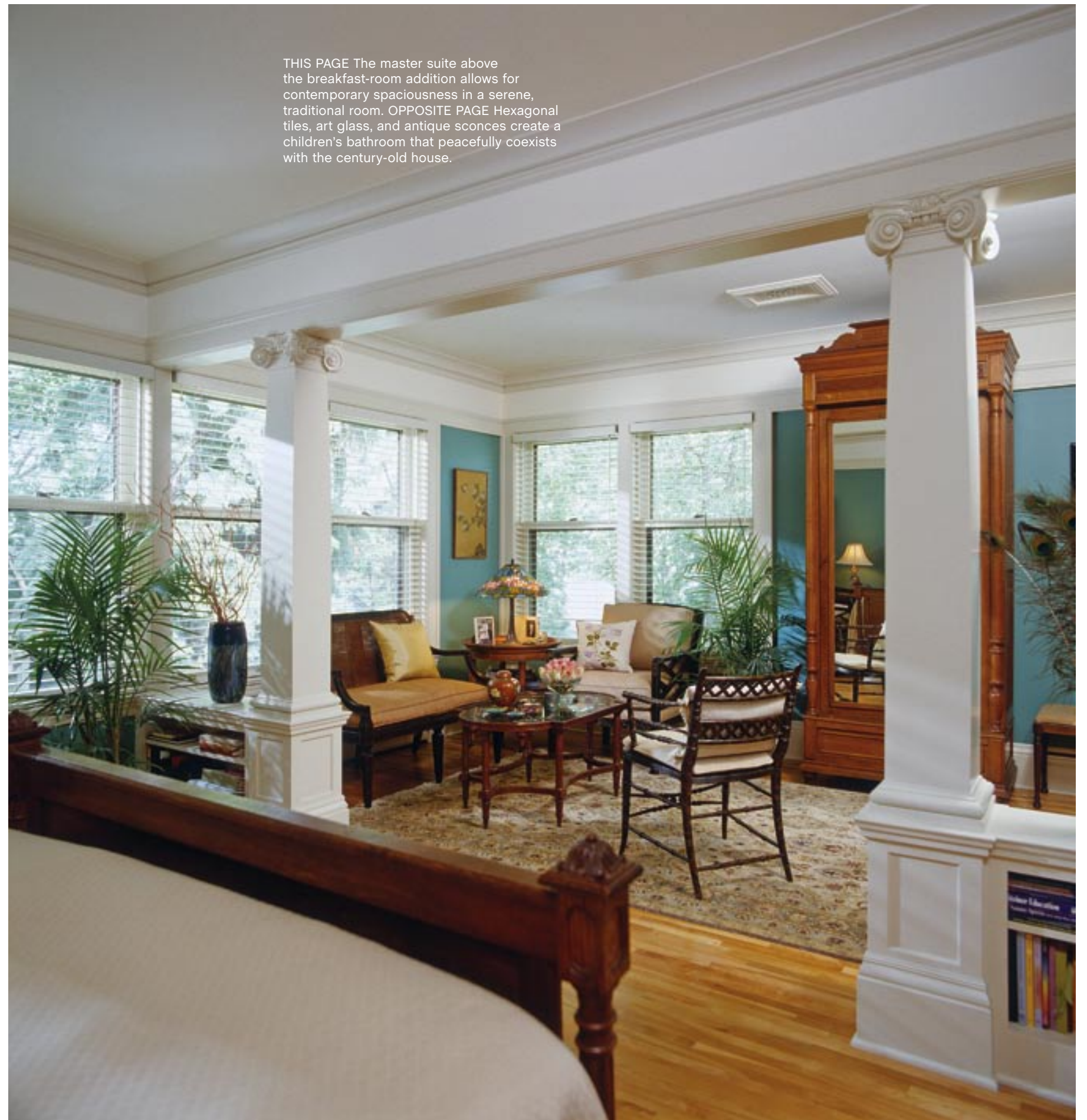
THIS PAGE The master suite above the breakfast-room addition allows for contemporary spaciousness in a serene, traditional room. OPPOSITE PAGE Hexagonal tiles, art glass, and antique sconces create a children's bathroom that peacefully coexists with the century-old house.