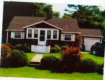
{ before }