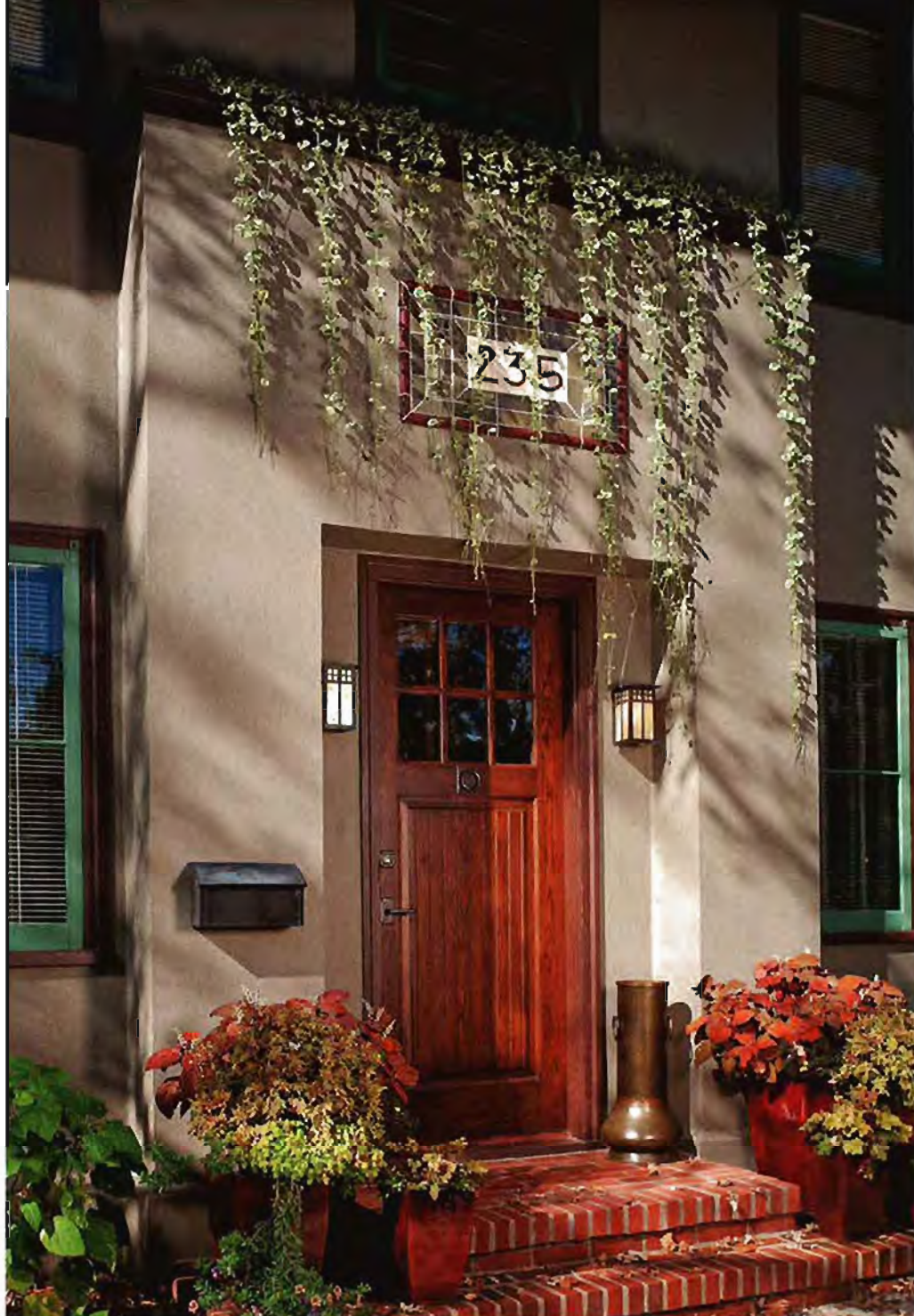
RIGHT: A bump-out accentuates the front entry, now handsomely restored and embellished with period accents BELOW: The Limbert chair holds a "Forget Me Not" pillow made from antique embroidery.