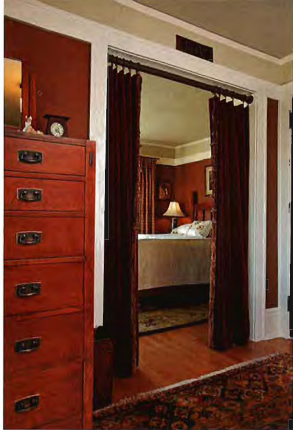
ABOVE: Vintage velvet portières frame the view from the dressing room into the bedroom. The bed and tall dresser are reissued pieces by Stickley. RIGHT: The new powder room has a painted cabinet designed by David Heide set off by black wall paint and tile in 'Derby Brown' from Mission Tile West. OPPOSITE BOTTOM: "The Stag," a period design by C.F.A. Voysey produced by J.R. Burrows, is framed in the breakfast room. This table is an antique Stickley Bros. piece.