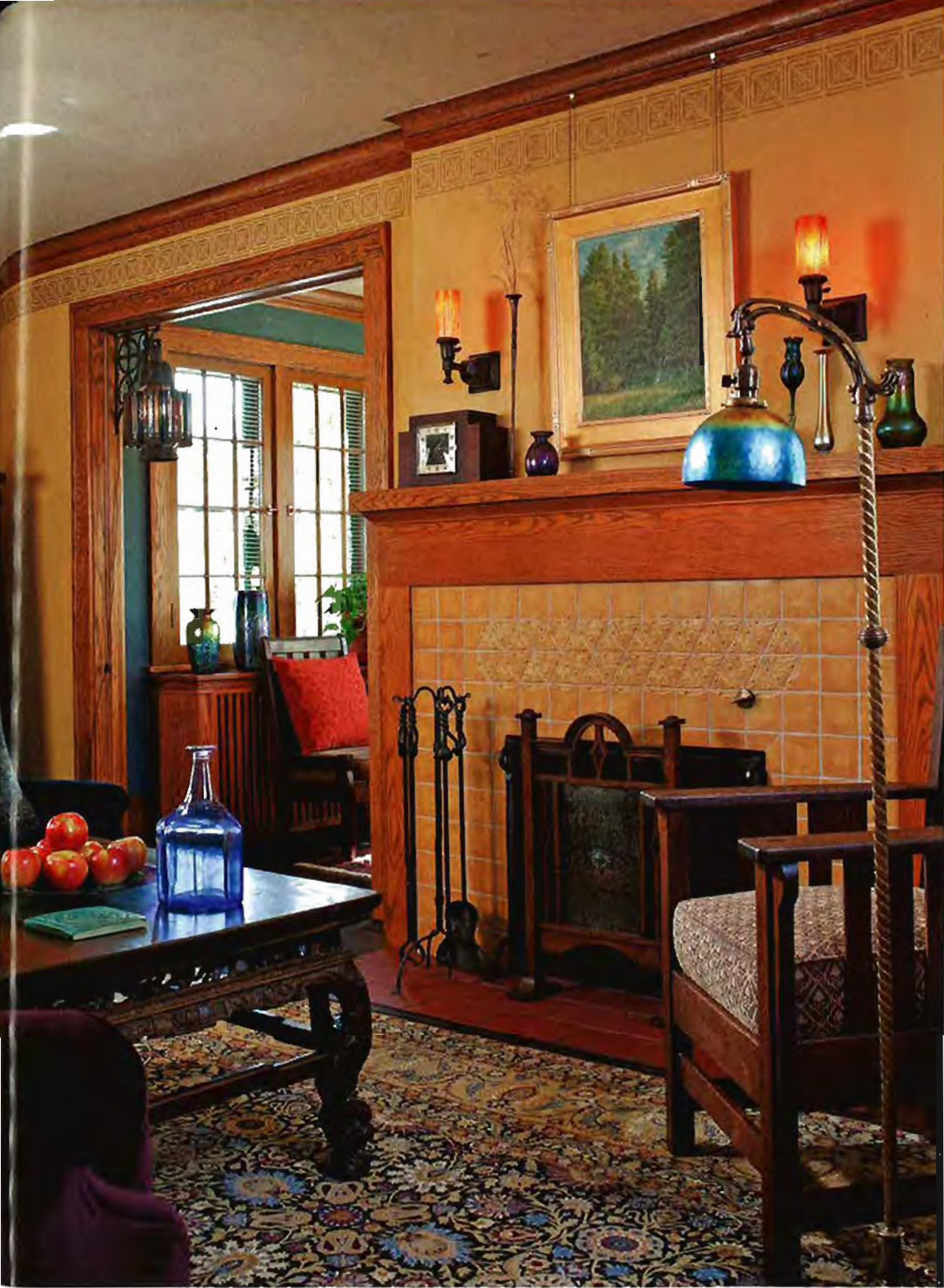
OPPOSITE: The Prairie School-influenced house was built in 1922; a new kitchen addition is discreet at the rear of the house. Period stencil designs in main rooms are quiet ornamentation (inset). LEFT: Woodwork is original; the fireplace surround of matte tiles is new. The fireplace screen is antique, as is the Lambert chair at right. BELOW: Antique pieces on the dining-room buffet.

the length of the front gutter; in the front yard, a tire swing hung from the spreading oak tree; torn canvas awnings flapped over the front door. Wildlife had begun to invade both house and garage. Things were no better inside. Because the previous owner's cat had used the crawlspace as a litter box, the sunroom held an obnoxious odor. (The only solution was to pour concrete on the ground in the crawlspace.) The interior was drearily painted