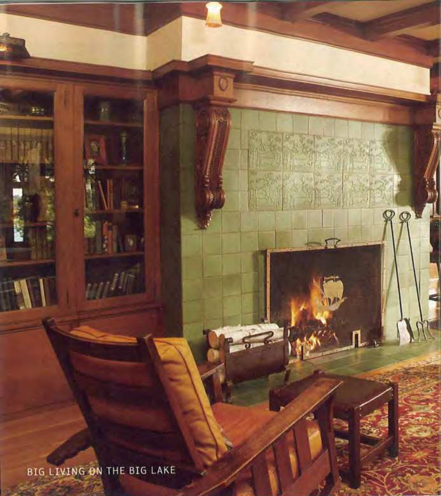
BIG LIVING ON THE BIG LAKE