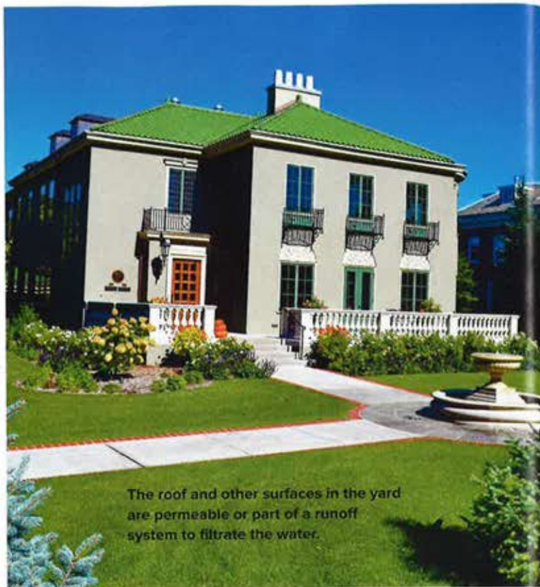
The roof and other surfaces in the yard are permeable or part of a runoff system to filtrate the water.