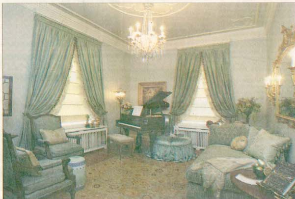
COLONIAL REVIVAL MUSIC ROOM Soothing celadon green envelops the soft, feminine space where women adjourned after dinner. Some of the furnishings are the homeowner's antiques, including the baby grand piano, with a chorus of music themed accessories. Wow factor: Handmade plaster relief molding and ceiling medallion add character and depth. Decorating tip: Dress luxe silk curtains with tassels and trim, or add a row of beading on plain Roman shades.