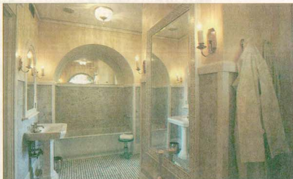
NEW OLD WORLD The new master bath seamlessly meshes an Old World flavor (curved archways, period marble mosaic tile and, yes, the original toilet) with a heated floor and spa-style shower. Wow factor: Half-moon art glass window (not pictured) repeats the leaded glass in the rest of the home.