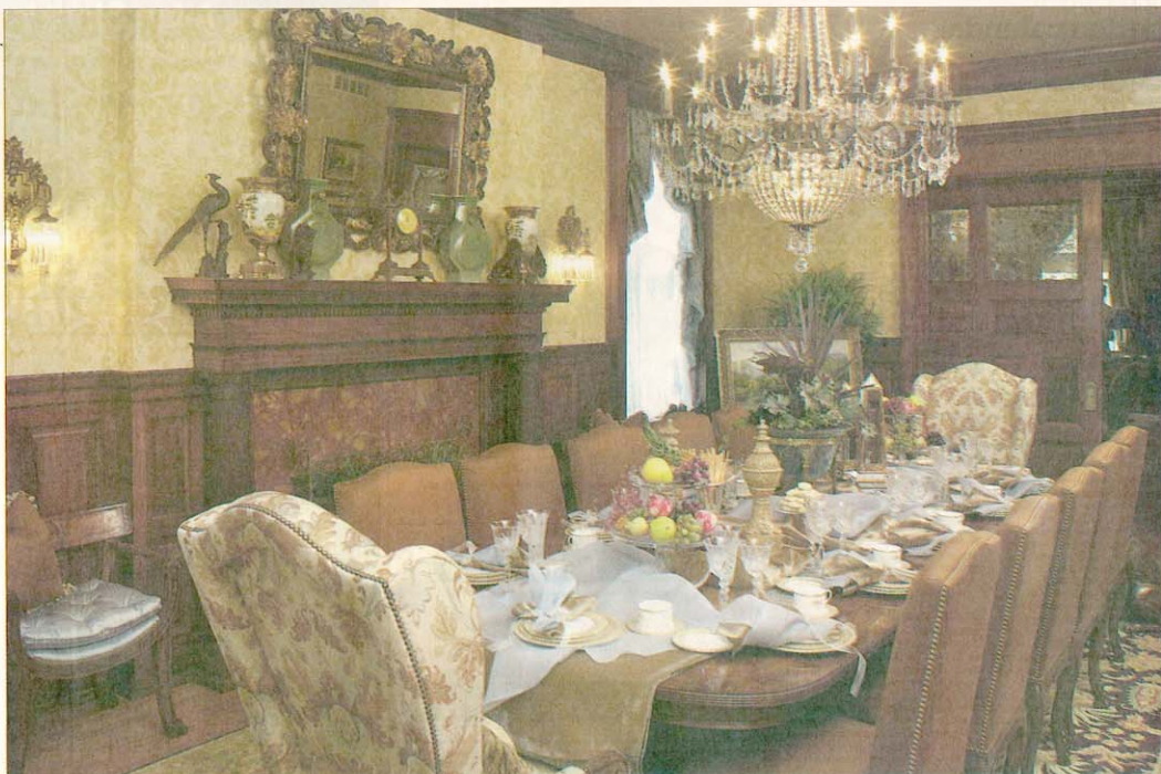
ROYAL DINING ROOM Dark Cuban mahogany woodwork and a handsome marble fireplace (one of seven in the home) set the stage for the opulent dining room. Furnishings and wall coverings blend French, English and a hint of Asian styles. Wow factor: French crystal chandelier reflected in the 19th-century reproduction hand-carved wood mirror. Decorating tip: Warm-hued grasscloth covers the ceiling to make a large room cozier.