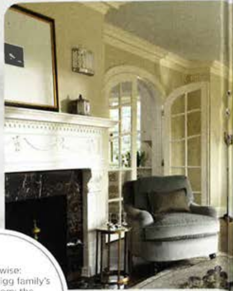
Clockwise: The Olson-Sigg family's music room; the Olsons' living room; the Olson-Siggs' kitchen and the Olsons' kitchen.