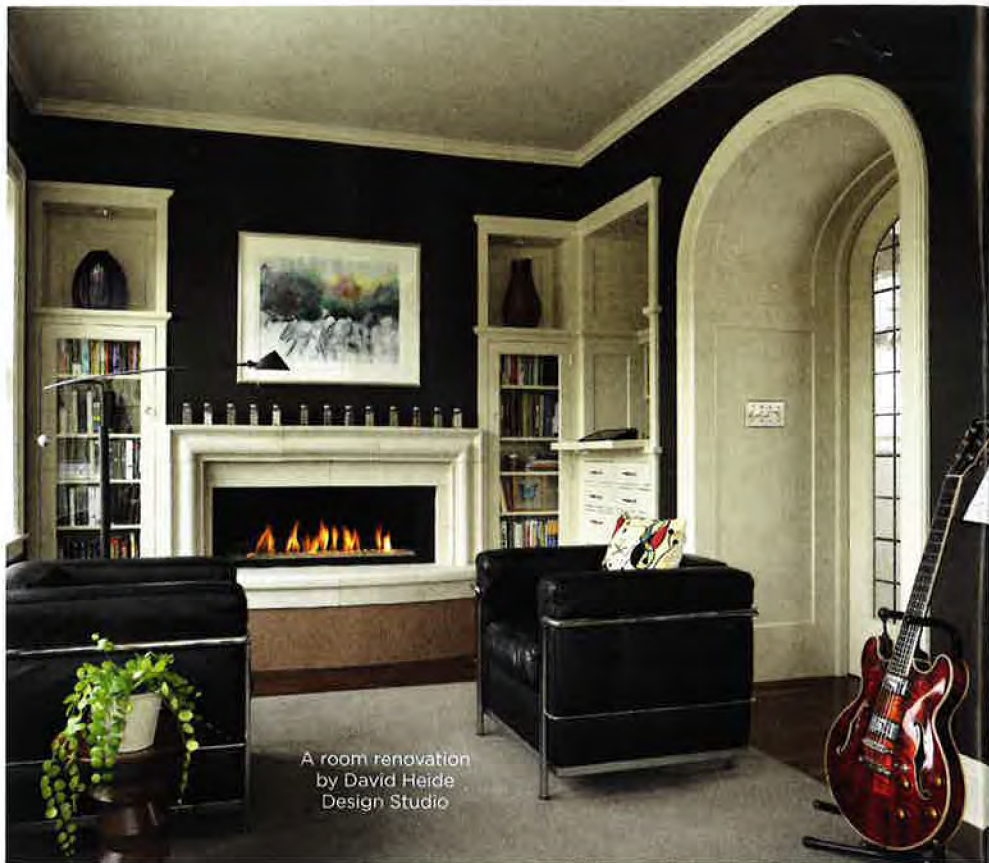
A room renovation by David Heide Design Studio

Whether it's summer and you're trying to stay cool, or the dead of a Minnesota winter and you're simply trying to ease the chill, home temperature regulation is key. Bonfe's offers a four-hour "Quick Heat Response" service guarantee,