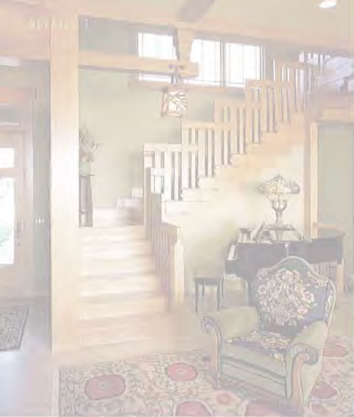
LEFT: The staircase in a recent California house interprets cloudlift patterns and hand joinery details famously seen in Greene & Greene's stair design for the Blacker House in Pasadena.