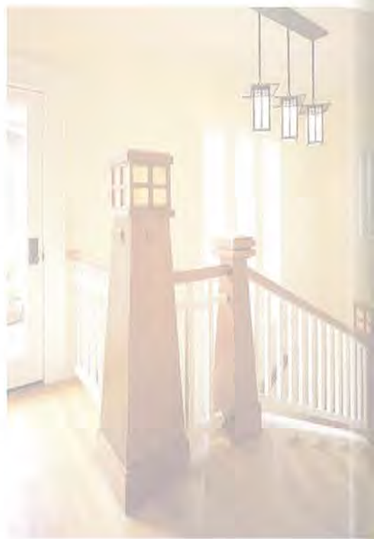
RIGHT: The crossbar motif in the newel posts in a new home in San Diego are repeated not only in the balustrade, but also in the windows and light fixtures.

from walking through the Gamble House," Erler says. "The consistency never lets down."