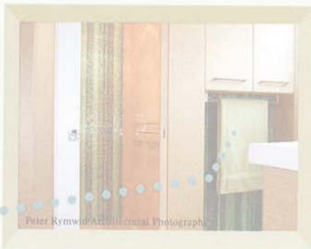
Create the best use for spaces with integrated storage solutions.

Note that front-loading washers offer a smaller footprint and some models can be stacked with dryers to free up more space for storage cabinets. Some of the front-loading machines offer storage under the units or pull out storage beside the units. One other item to consider in the laundry room is a built-in ironing board or one that pulls out from a cabinet drawer. If there's no broom closet, make sure you install a hanging device designed to hold