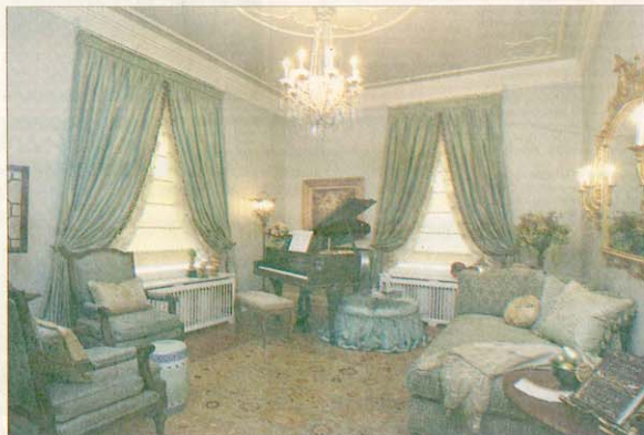
COLONIAL REVIVAL MUSIC ROOM Soothing celadon green envelops the soft, feminine space where women adjourned after dinner. Some of the furnishings are the homeowner's antiques, including the baby grand piano, with a chorus of music-themed accessories. Wow factor: Handmade plaster relief molding and ceiling medallion add character and depth. Decorating tip: Dress luxe silk curtains with tassels and trim, or add a row of beading on plain Roman shades.