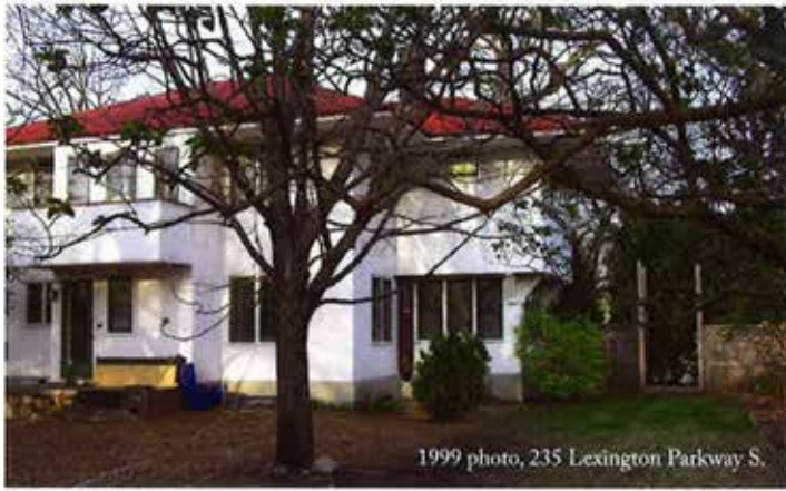
1999 photo, 235 Lexington Parkway S.