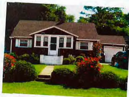
{ before }